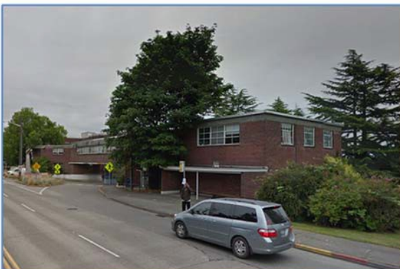
Climbing Wall near Parking Area is Shown Below: